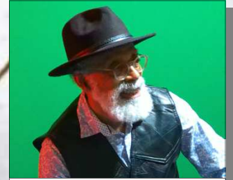
Let us be ready...

"To you, O men, I call, And my voice is to the sons of men. O you simple ones, understand prudence, And you fools, be of an understanding heart."